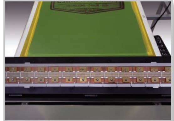
Efficient shuttling high-output UV LED system