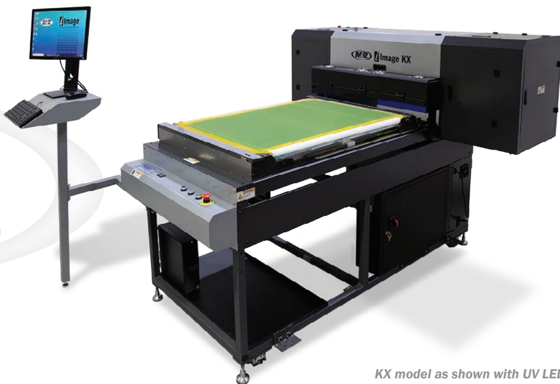
KX model as shown with UV LED system. UV LED system is not retro-fittable to the K model.

M&R's i-Image KX is a large format computer-to-screen (CTS) imaging and UV LED all-in-one exposure system. The KX dramatically reduces the time and effort required to prepare imaged screens by combining CTS imaging and UV LED screen exposure in one machine.