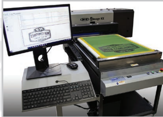
RIP PC and software included

The i-Image KX is M&R's solution for fast, efficient production of oversized screens. Combining advanced imaging with a built-in UV LED exposure system greatly improves shop efficiency and speed for pre-registered, accurate image production.