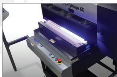
Efficient shuttling high-output UV LED system